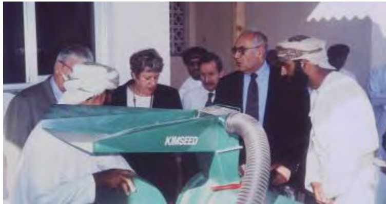
New seed technology unit inaugurated at the agricultural research station, Rumais, Oman