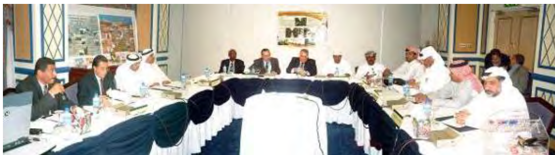
APRP Steering Committee Meeting

This was followed by discussions on ICARDA-APRP activities and achievements, financial situation and future plans and projects.