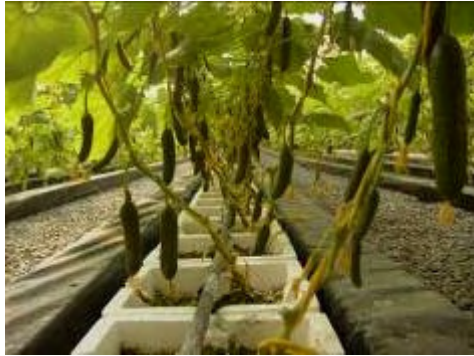
Adopting soilless growing techniques in the farmers field in Oman: collaborative activities of ICARDA-APRP and MAF, Oman