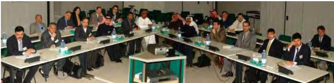
Participants in the Agricultural Research Systems and Strategies in the GCC countries workshop from seven GCC countries and ICARDA