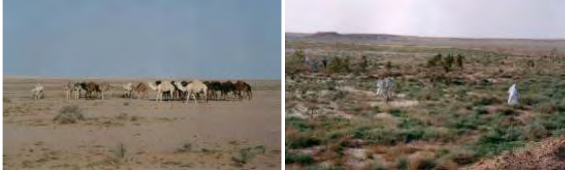
Over stocking the range with Camels (left) can exhaust vegetation cover while low or no animal grazing allow pasture to recover rapidly (right) in Al Jouf, Northern Saudi Arabia

The study will monitor vegetation productivity, composition and quality. The parameters to be monitored related to the animal include body weight changes and supplementary feed. Animals will be weighed once every month. The flock composition in each grazing paddock is one male and two females (dry animals). The study was started early December 2004 and is expected to continue for five years.