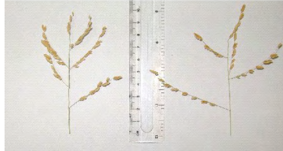
Late formed tillers of Dakhna ( C. piercei L.)