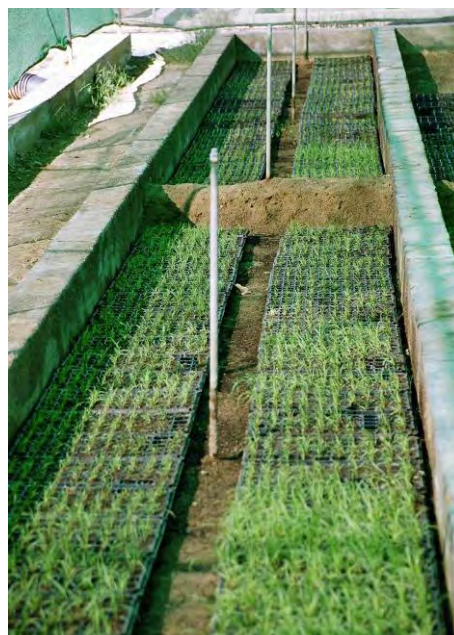
On-farm activities to introduce new grass forages with high water-use efficiency in UAE