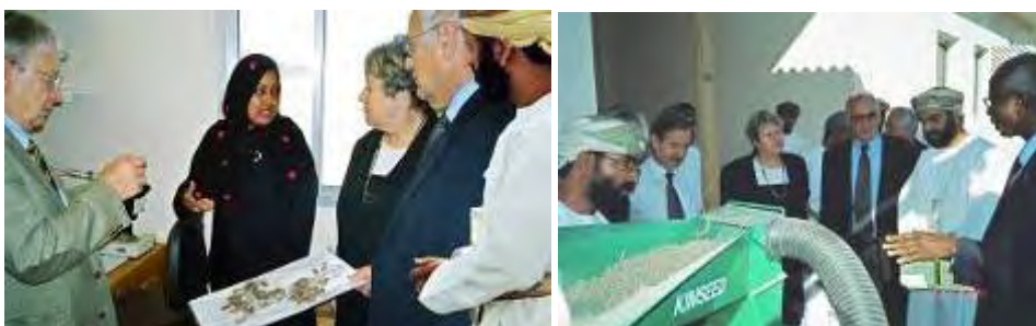
The Chairperson of ICARDA's Board of Trustees and the Director General inaugurated the Seed Technology Unit at Rumais, established in collaboration with ICARDA. The national staff, who received training at ICARDA, proudly explained the operations of the Unit to the visitors.