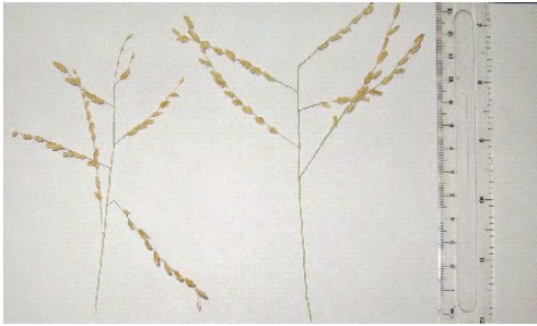
Early formed tillers of Dakhna ( Coelachyrum piercei L.)

(mg), seed recovery (%) from inflorescence and germination %. It is recommended that when harvesting grass seeds emphasis should be given to early formed tillers in order to maximize seed quantity and quality.