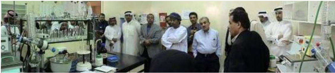
RTCM Participants visiting the Laboratory and research equipment at Rumais ARC