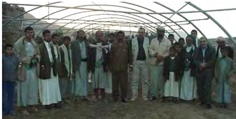
Dissemination of greenhouse production technology to the Yemeni growers