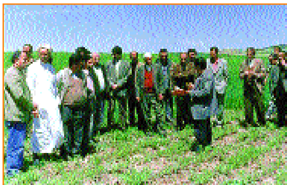
A farmer field day on food legumes cultivation at Setif experimental station.

ICARDA has always emphasised the importance of capacity building of national scientists so they can work as equal partners in collaborative research. During the last two decades, 458 scientists and technical staff from Algeria have participated in the various training programs of ICARDA. Thirty-five researchers and technicians, primarily from ITGC cereals, food legumes and forage improvement programs, benefited from ICARDA's long-term training programs. In addition, ICARDA scientists have supervised several Algerian scientists who have now obtained PhD degrees.