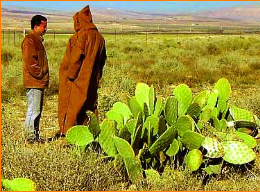
An Algerian scientist discussing with a farmer the merits of saltbush and spineless cactus, tested by ICARDA, as winter and emergency feed for livestock and to prevent soil erosion and land degradation.

overgrazing, consecutive years of drought, and demographic pressure. This project is looking into the environmental dynamics, the prevailing practices and use of the resources as well as socioeconomic and political factors causing the degradation. The study is focusing on agropastoral practices to understand the complexity of factors behind the management of agropastoral resources. The ultimate aim of the project is to develop appropriate procedures for range management and rehabilitation by involving local communities, authorities and other partners.