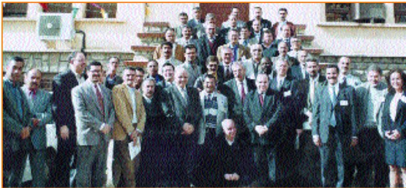
Participants of the Regional Technical and Planning Meeting of the Mashreq/Magreb project hosted by Algeria in November 2000 and inaugurated by His Excellency Dr Saïd Barkat, Minister of Agriculture.

Also known as the Mashreq-Maghreb (M&M) project, this was a very successful regional collaborative research project implemented in two phases (1995-1997 and 1999-2002). Its main objective was to develop more productive and sustainable small ruminant-based systems through the integration of crop and livestock production within and across barley and range-based systems. It enabled the Algerian national program to benefit from the experiences of seven other participating countries, four from the Mashreq (Iraq, Jordan, Syria, and Lebanon) and three from the Maghreb region (Tunisia, Libya and Morocco).