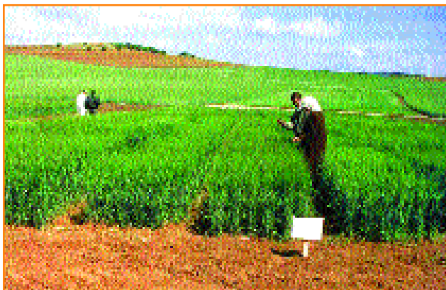
Screening ICARDA cereal germplasm at an ITGC experi- ment station.

Most of the barley in Algeria is grown in harsh, unpredictable drier environments with no chemical inputs. Introduction of a participatory breeding approach during the past few years has enabled the development of cultivars for specific adaptation to such environments. The objective is to improve barley productivity under small farmers' conditions by exploiting specific adaptation and by making use of indigenous knowledge.