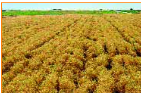
ILL 4400, a high yielding and large-seeded green lentil variety released in Algeria in 1988.