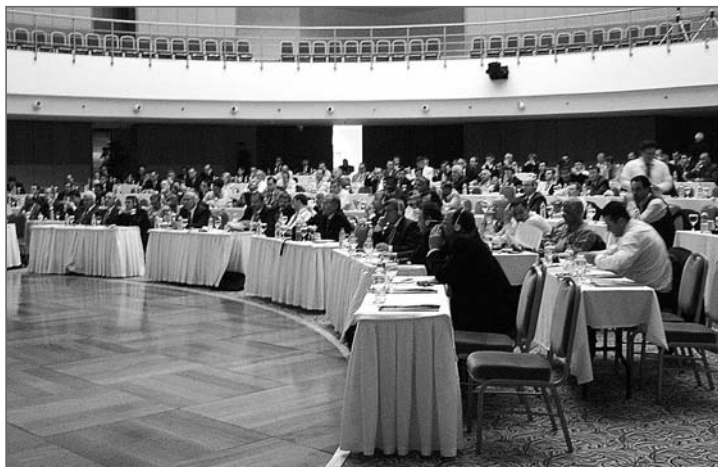
The first International Seed Trade Conference (ISTC2005) in CWANA, Antalya, Turkey.

business dealings for potential customers and suppliers. Such regional and international congresses are becoming increasingly important in international seed trade where a lot of business dealing is taking place.