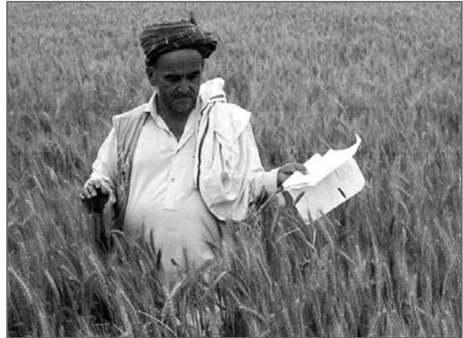
A VBSE member farmer inspecting wheat production fields for seed quality in Afghanistan.

Seed Production Technology and Enterprise Management: a Train-the-Trainer Course, 16-24 February 2004, Kabul. The purpose was to train staff from support-providing institutions (Ministry of Agriculture, Development Agencies, NGOs, etc) to acquire knowledge in seed technology and enterprise management to enable them provide support and guidance for establishing and operating local small seed enterprises with farmers. A total of 41 participants attended the course. The course was participatory in nature including a mix of introductory lectures, practical sessions and exercises on seed technology and financial management issues. Working group discussions were structured along four themes: (a) farmers' local knowledge in seed selection and management; (b) crop specific guidelines for quality seed production under the VBSE scheme; (c) opportunities and challenges in establishing and operating VBSE; and (d) technological and institutional support required for operating VBSE.