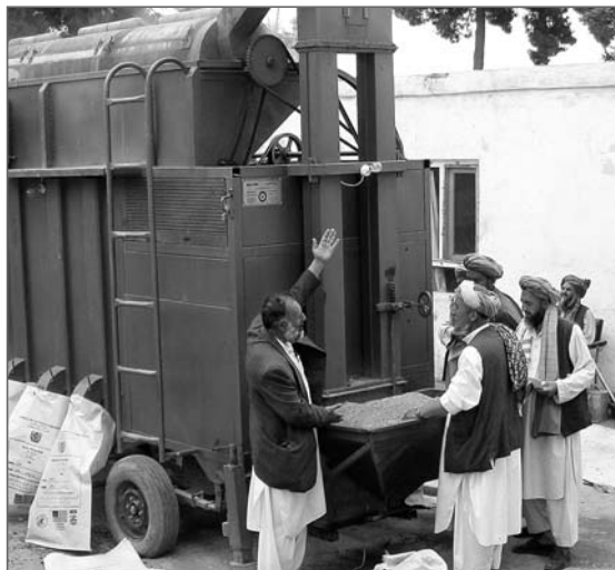
Demonstrating a mobile seed cleaner and treader to VBSE member farmers during a training session in Afghanistan.

Quality Assurance and Seed Processing, Jalalabad (19-21 April 2005) and Kunduz (24-26 April 2005). Two separate courses were organized to provide VBSE members with skills for quality seed production. A total of 104 participants (51 in Kunduz and 53 in Jalalabad), mainly VBSE members and staff working with the MAAH, FAO, NGOs and ICARDA technical field staff attended the two courses. The participants came from Baghlan, Bamiyan, Ghazni, Herat, Kabul, Kunduz, Helmand and Nangarhar, Parwan and Takhar provinces.